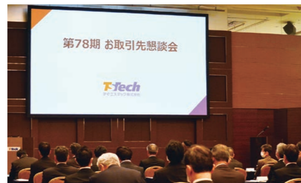
Annual conference with major business partners

The TS TECH Group facilitates communication with business partners by providing opportunities to share information regarding purchasing strategies and policies. We hold an annual conference with major suppliers to explain our medium-term management plan and operating policies and to exchange information. After switching to video distribution due to the COVID-19 pandemic, in April 2023 we held an in-person meeting for the first time in four years, strengthening unity with each company to promote our 15 th Medium-Term Management Plan by working together as one.