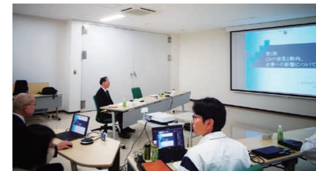
Carbon Neutrality Seminar

We also examine components to ensure they do not contain chemicals prohibited by laws and regulations in each country and region. We do not permit the use of chemicals prohibited by laws and regulations, even in manufacturing processes within supplier companies. Additionally, we have established rules to monitor the emissions of specified chemical substances designated by laws and regulations, and to report any issues that may arise to the relevant government.